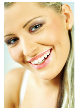
Take care of your skin for a healthy glow this summer.