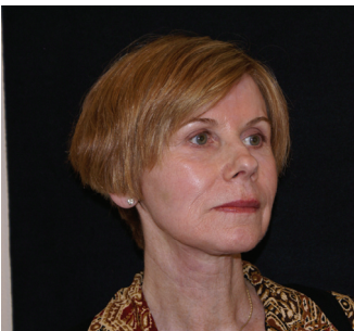
Mini Lift Before and After